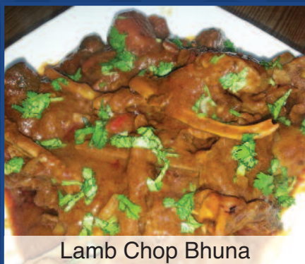
Lamb Chop Bhuna

*Meal Deals, collection only. £1 extra charge for delivery