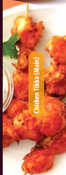
Chicken Tikka (Main)